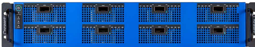
Spirent B2 800G 8-Port Appliance

Terabit Routers —Test latest generation of core routers with high-scale, multiprotocol topologies.