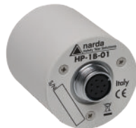
Magnetic field probe

This means that emissions from high-voltage cables and transformer stations can be recorded. Further, it is possible to combine up to two probes, e.g. an electric and a magnetic field probe in the so-called “dual probe configuration”.