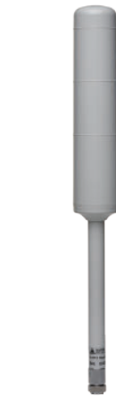
Electric field probe