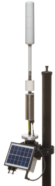
Dual probe configuration (without radome)