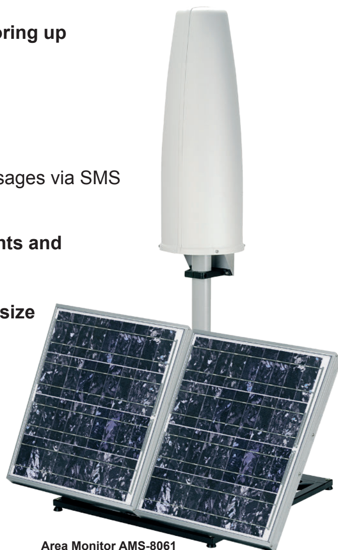
Area Monitor AMS-8061 with Solar Panel