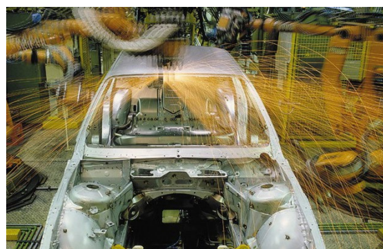
Resistance welding machinery in operation