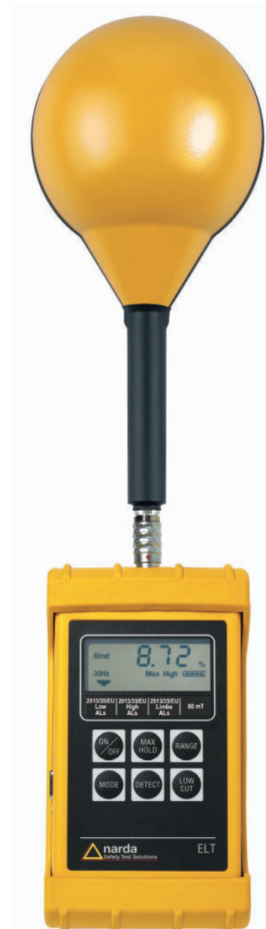
Exposure Level Tester ELT-400