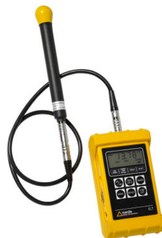
Coupling factors can be determined in compliance with IEC/EN 62233 by use of the optional 3 cm 2 probe

The variation with frequency specified in the standard is normalized by means of an appropriate filter. Users no longer need to know the frequency or the frequency-dependent limits. The standard is easily selected by pressing just one button. Multi-frequency signals are just as easy to measure as single frequencies.