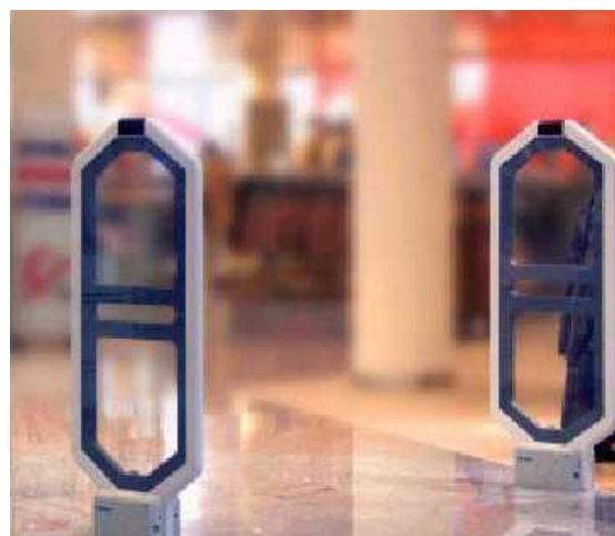
Magneto acoustic gate used for product surveillance