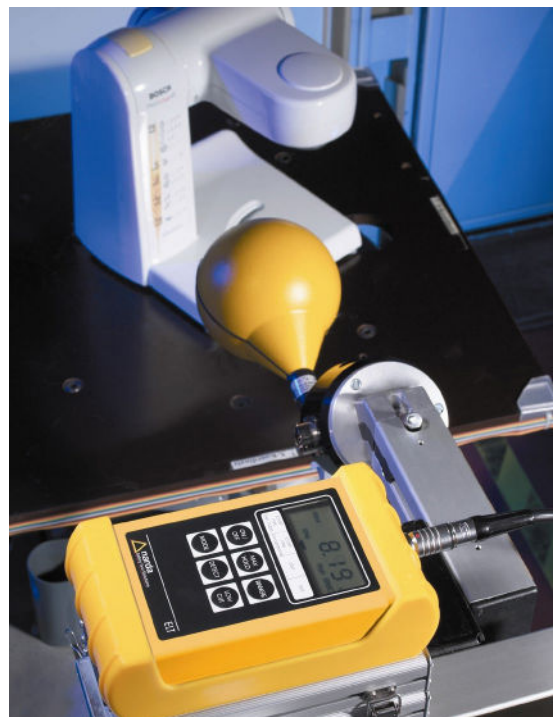
Compliance testing of household appliances

The optional probe extension cable is specially designed for low influence on the frequency response and sensitivity of the instrument. The cable is a good choice in cases where the probe and instrument must be handled separately. Variants of the ELT-400 are available with different operating mode combinations, e.g. "Exposure STD" or "Field Strength". Please refer to the Ordering Information section for details.