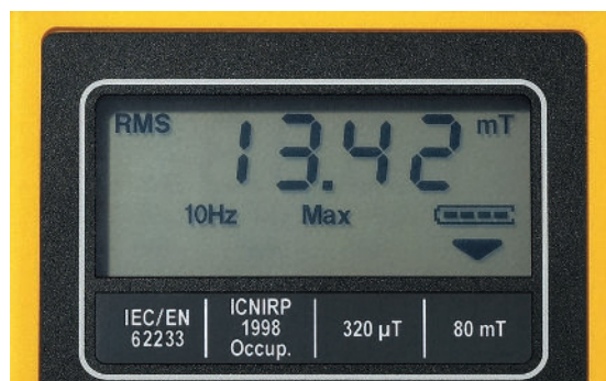
Broadband measurement in “mT” with RMS detector

The ELT-400 provides an ultra wideband, flat frequency response. The measurement range can handle extremely high field strength levels. Both detectors, RMS and Peak, are available for broadband measurement. The field strength result is displayed in “Tesla”.