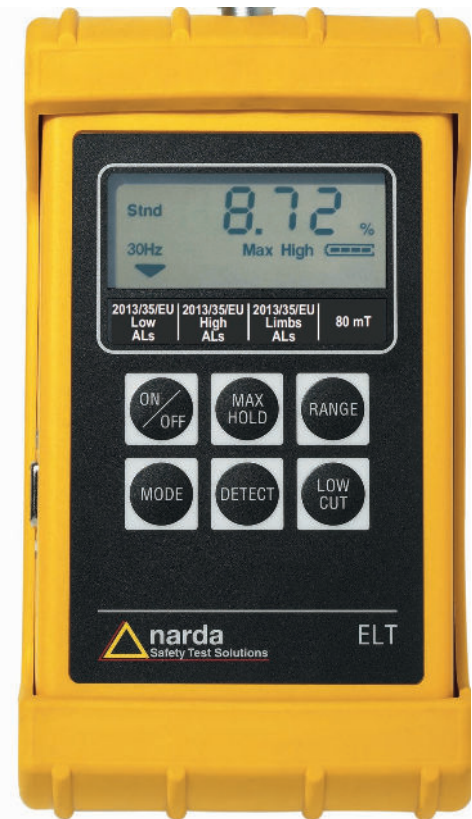
In Exposure STD mode the result is displayed directly as a percentage of the permitted limit

Proper evaluation in a personal safety context is achieved quickly and reliably using the STD technique.