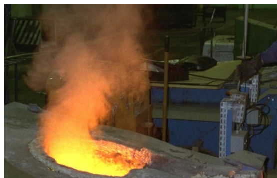
Industrial melting furnace

The ELT-400 allows to greatly simplify the assessment process. With EXPOSURE STD (Shaped Time Domain) mode, the instrument achieves a new standard in simple but reliable measurement of magnetic fields, whether in straightforward or in very complex field environments.