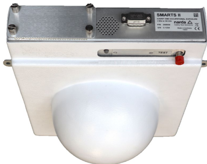
Fig. 1. SMARTS II on ceiling

The alarm threshold is field adjustable from 10% of standard to 50% of standard. The user can easily switch from battery operation to an external, low voltage DC supply.