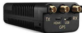
Matchstiq S Series Platforms