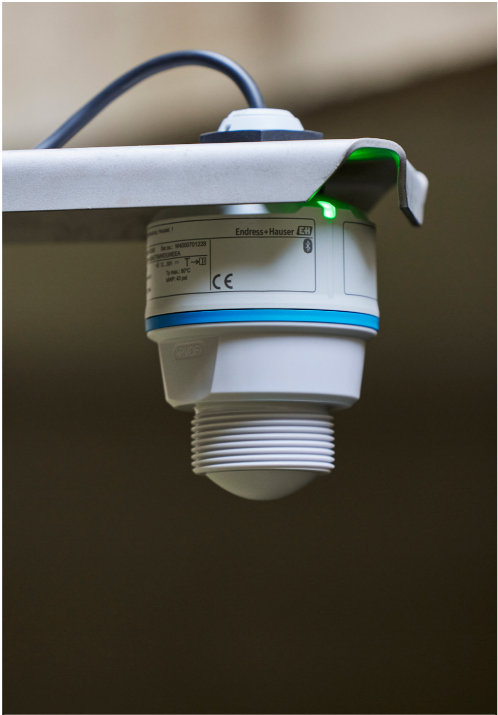
Easy operation ▾