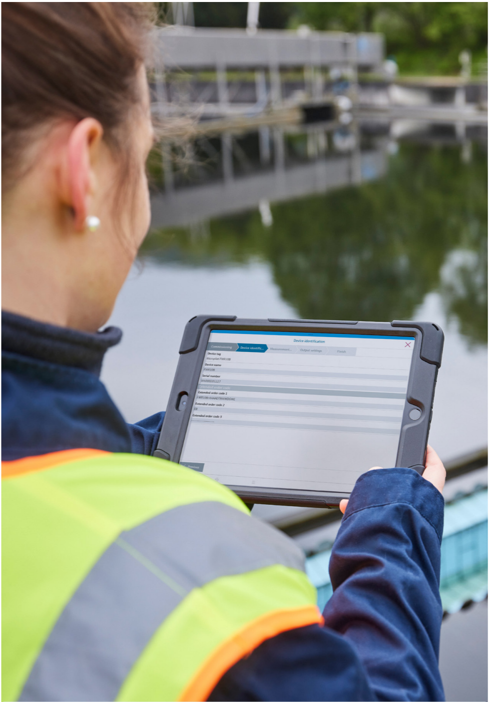
Fast commissioning ▾