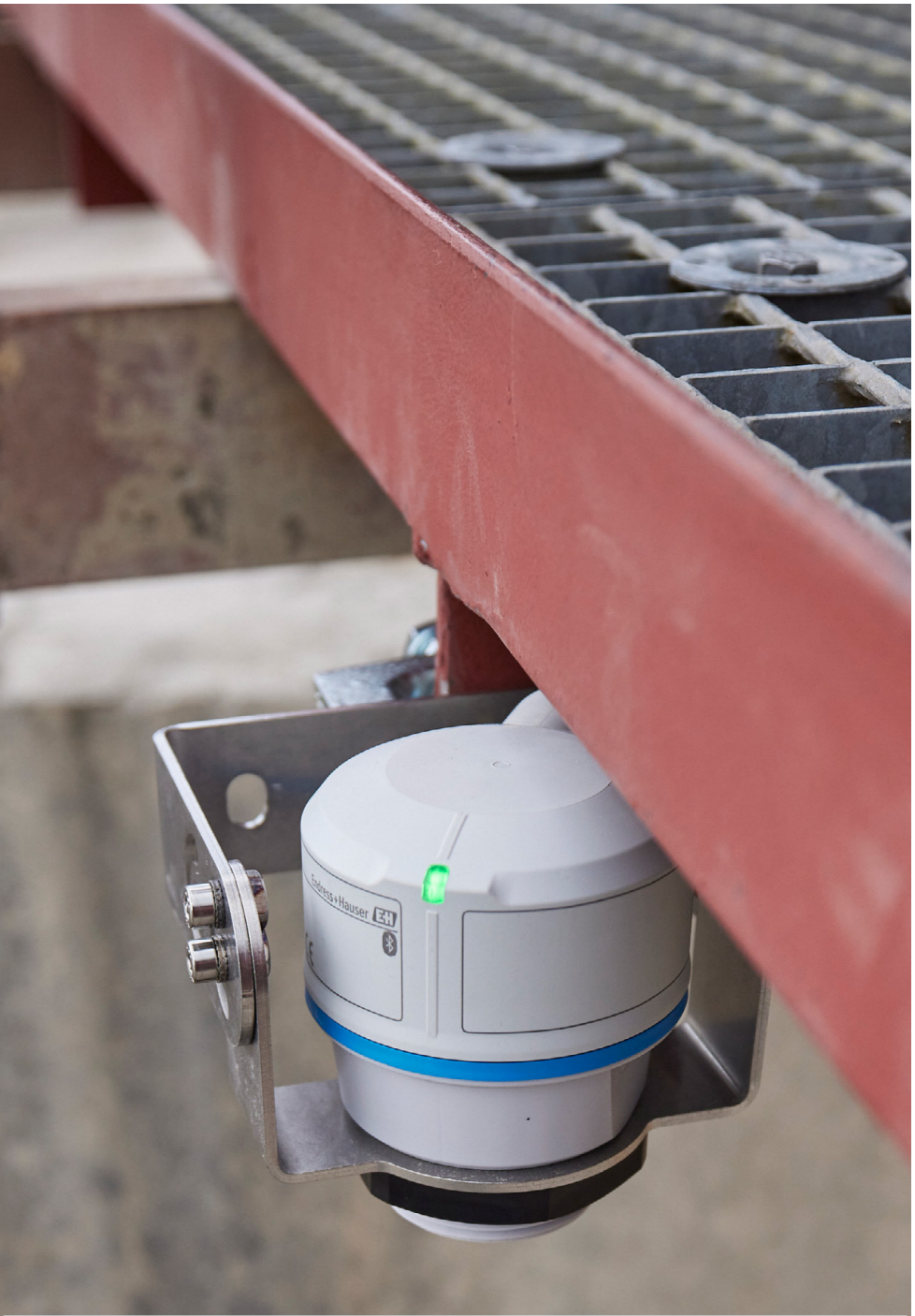
Straightforward device selection ▾

Fast and easy commissioning thanks to step-by-step guided setup sequences (wizards) in less than three minutes. Bluetooth connectivity enables easy, reliable and encrypted wireless remote access via smartphone or tablet.