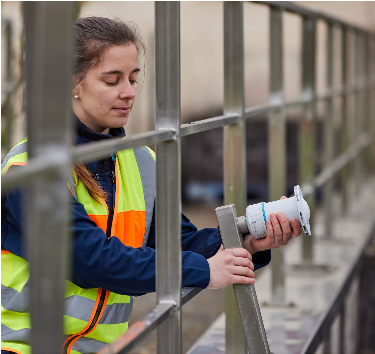
Reduced installation effort ∨

Customized installation thanks to application specific accessories. 1:1 replacement makes integration of the devices easy.