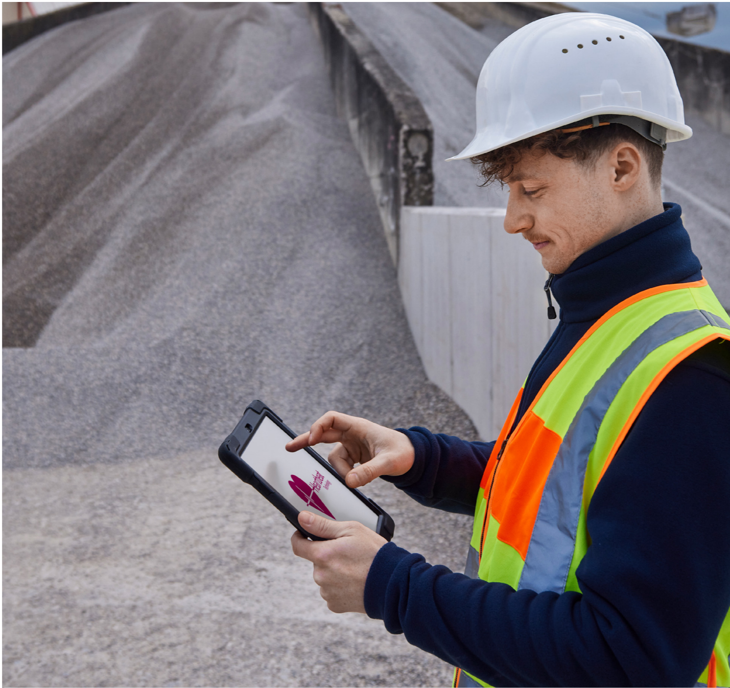
Reliability and reduced downtime ∨